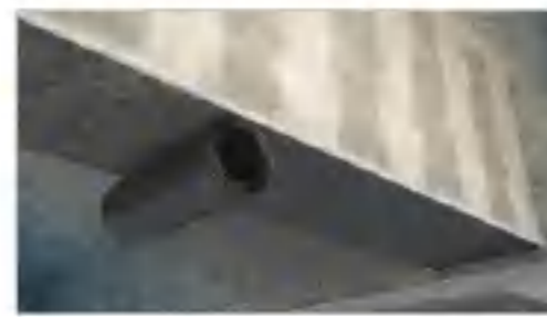
pasting carbon fiber cloth