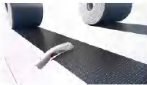
cutting carbon fiber cloth