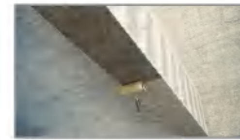
applying epoxy resin adhesive