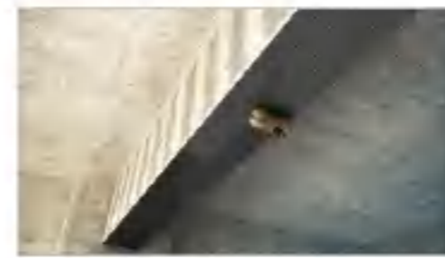
applying adhesive again